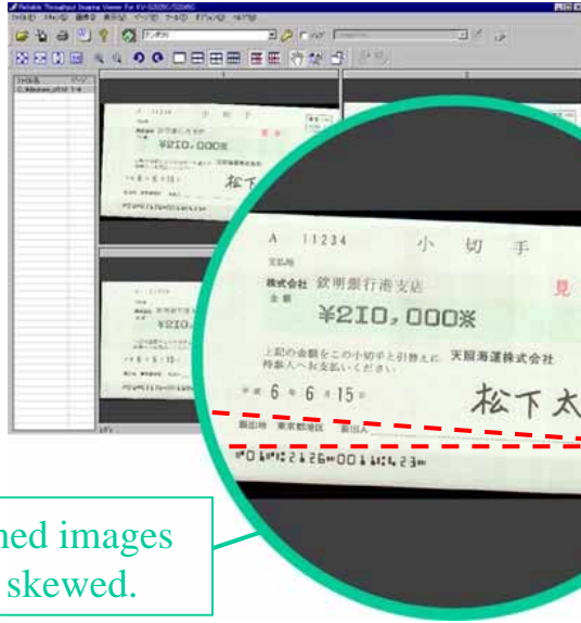
Scanned images are skewed.

With skew removed, the B&W or Color document is in the correct position.